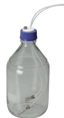
Opti-Cap™ Kit with bottle